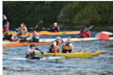
A 100-mile river race