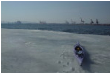
Breaking the Ice: Winter Paddling